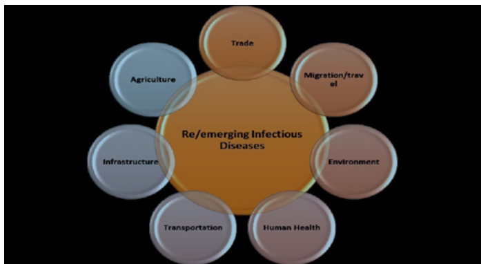
Figure 2: Sectors with a role in emerging/re-emerging infectious disease preparedness and response.

The multi-sectoral approach is further expanded upon in the One Health framework and highlights the importance of the interconnectivity between numerous sectors integral to disease response [18,24-26]. The fact that we do not know with any certainty where, when, and how a disease will emerge is the critical challenge. Funding for prevention and mitigation efforts are limited due