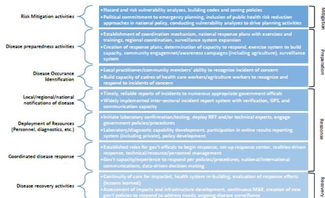
Figure 2: Cascade of EID response with potential points of engagement.

There were clear strengths and limitations to our review. Strength of the review was that the use of the specific eligibility criteria and search process made narrowing down relevant articles efficient and straightforward. A limitation of the review was that the search could have been more comprehensive with the inclusion of other databases. However, for the two databases used – scaling the search to the past ten years provided a significant amount of relevant search results.